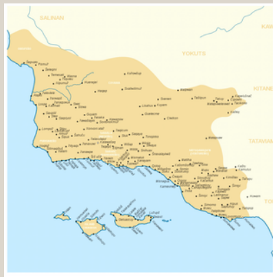
Map of Chumash Land

"Native American Heritage Month is a time to reflect and remember all of the various experiences and cultures of the indigenous peoples of the Americas. We as native peoples share a common experience with dealing with the traumas of colonization from that time to now. It is our duty to keep our traditions and culture alive so that we can pass on our identity, knowledge and livelihoods to those who are not yet born in this world. It is through higher education that we as native peoples may achieve new found success and restore our abilities not only to persevere but to thrive in this ever changing modern world."