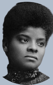
Ida B. Wells