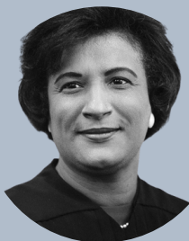
Constance Baker Motley