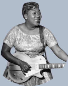
Sister Rosetta Tharpe